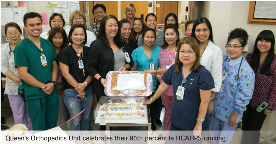
Queen's Orthopedics Unit celebrates their 90th percentile HCAHPS ranking.